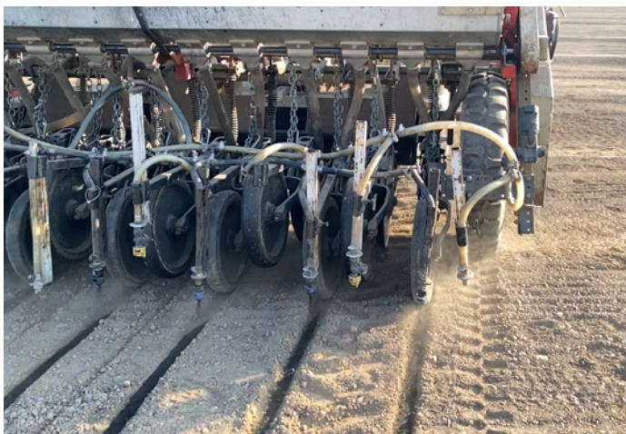
Biochar slurry application using a sprayer.

Micronized biochars can be suspended in water and injected into the root zone of perennial crops or fertigated, which could provide a slow but steady method of adding biochar to the root zone via irrigation water.