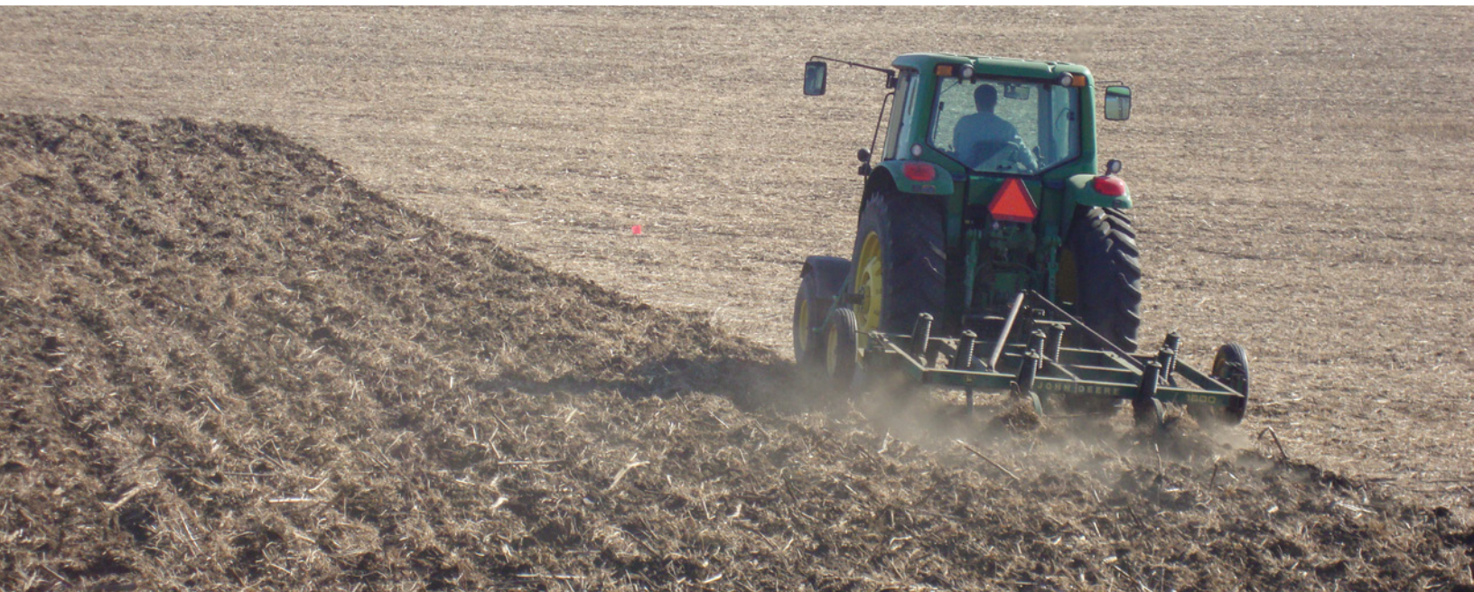
Biochar being incorporated after broadcast application to an Iowa corn field.

RESULTS: Biochar plots increased wheat yields, soil moisture levels, and fungal community abundance relative to both the no amendment control and lime treatments in 2013. Soil pH increased by a similar amount for both amendments. In 2014, both amendments increased wheat yields relative to the no amendment control. Overall, biochar increased yields by 280% (lime by 200%) over both years. 16