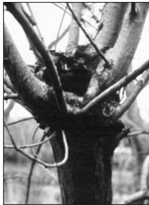
Topping trees results in large areas of decay and fast-growing, weak, and unattractive watersprouts.