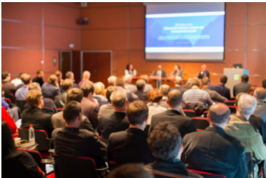
SORGHUM BOARD TO MEET