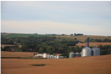
Sales Tax on Nebraska Farmland Voted Down in Committee