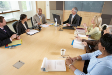
Sorghum Board Seeks Applicant for Open Seats