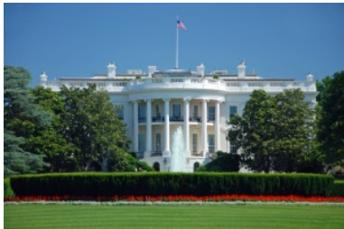
Diverse Coalition Urges White House and U.S. Trade Reps to Stand Strong on COOL