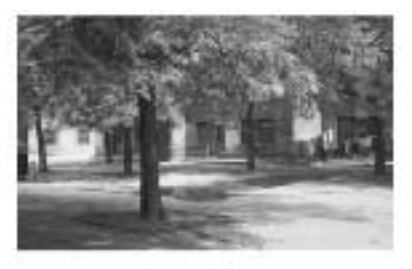
Figure 1: Ground Level View at Ida B. Wells Showing Apartment Buildings With Varying Amounts of Tree and Grass Cover

leaving some areas completely barren, others with small trees or some grass, and still others with mature high-canopy trees (see Figure 1). Because shrubs were relatively rare, vegetation at Ida B. Wells was essentially the amount of tree and grass cover around each building.