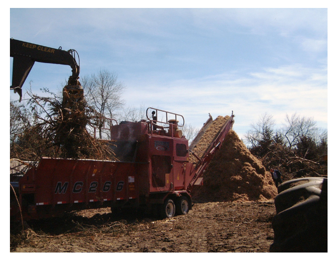
To decrease forest fuel loads, timber is removed either by hand or mechanically (above). Leftover debris, also called slash, is either scattered to decompose; piled for controlled burning or wildlife habitat; or chipped for use in woody energy systems. Chadron State College currently uses 9,000 tons of wood chips each year to heat and cool more than 1 million square feet of building space.

Using state and federal funds, NFS is able to provide eligible forest landowners up to 75 percent cost-share assistance for fuels treatment projects on their forest land. These programs are currently open to forest landowners in the Pine Ridge and Niobrara Valley areas.