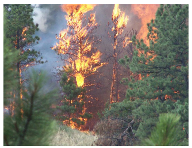
In overstocked forests, fires can quickly spread from the ground into the forest canopy. These highly destructive crown fires spread rapidly and are difficult—and dangerous—to suppress.

As the crowns of trees are consumed by fire, there is a tremendous release of energy. This heat energy creates powerful columns of rising air capable of carrying firebrands, such as burning pine cones or small branches. These firebrands cause spot fires in front of the advancing fire and rain down on structures in the fire's path, putting property—and lives—at risk.