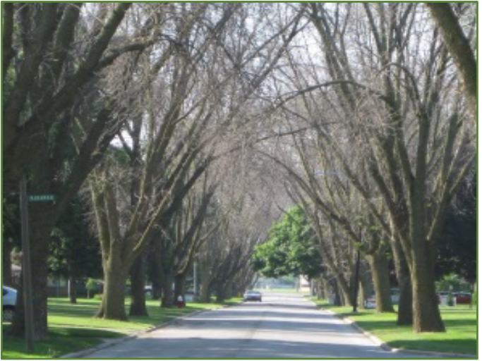
Same street in 2009.