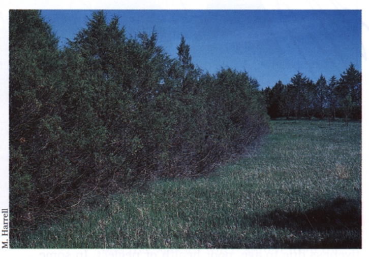
Cercospora needle blight is a serious problem in Juniper windbreaks. Annual observations of your windbreak will help you identify any problems and allow for treatment before they become severe.

tion have different design requirements and require different renovation techniques. In addition to your primary objectives, determine any secondary benefits you want in your windbreak. Is snow management a concern? Do you want to attract more wildlife? Consider your overall farm or ranch operation. Is the original design still meeting your needs? Is the windbreak located in the right place? Remember that the windbreak that will result from your efforts could be there for the next 50 years. Clearly identifying your objectives is important because it will help you determine the best species, the best design and the optimal location for the windbreak.