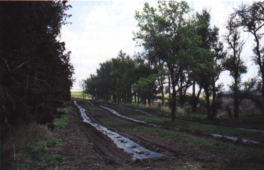
Planting several rows of trees within an existing windbreak is one method to increase windbreak density. Using a fabric mulch to control competing vegetation increases tree growth and reduces the amount of labor required.

Removing interior tree rows can provide additional growing space for adjacent rows or planting space for replacement rows. As a general rule, one row of new trees can be planted for every two rows removed. Species selected for replanting should complement species that remain from the original planting and should be able to grow in the shady environment of the windbreak interior. Competition from the adjacent tree rows can be reduced by root pruning.