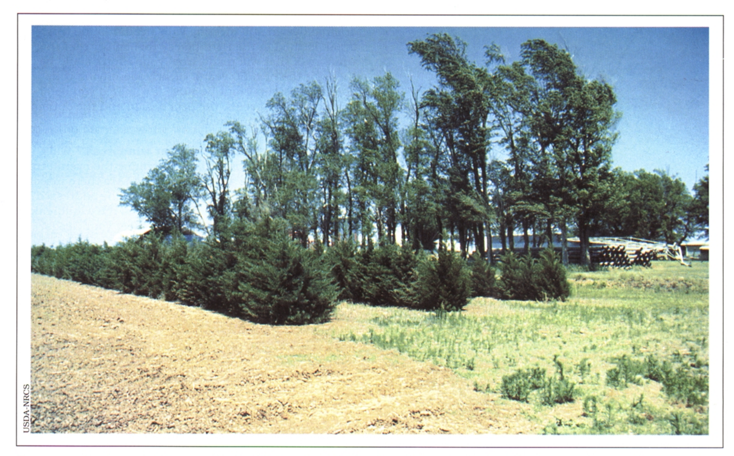
Three rows of eastern redcedar were added to this farmstead windbreak providing protection from blowing snow. In several more years the remaining rows of Siberian elm should be removed and replaced with two or more rows of tall, deciduous trees such as green ash, hackberry or oak.

There are many techniques available. This guide is designed to provide a step-by-step approach for restoring the effectiveness of your windbreak. With careful planning and follow-through, renovation of your windbreak should lead to the development of a healthy and functional windbreak.