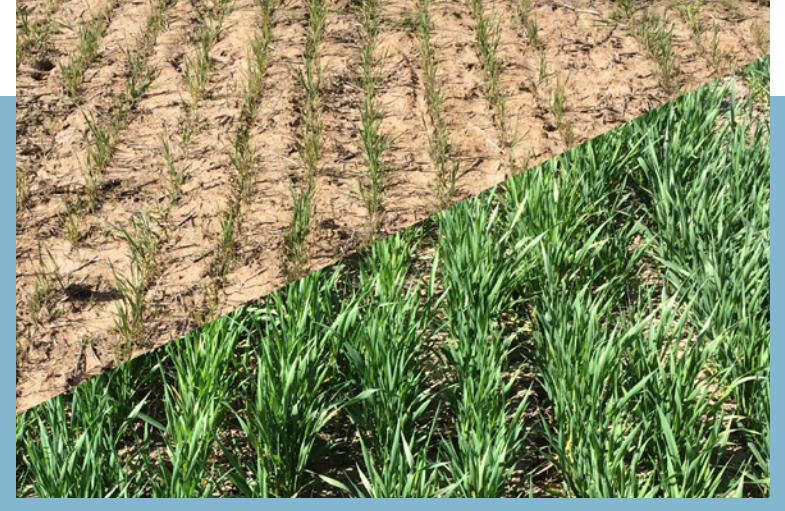
The growth of wheat in Eastern Washington in soils amended with biochar vs. unamended soils.

In 2013, the USDA-ARS established trials at the Gady Farm to compare the impacts of the seed cleaned