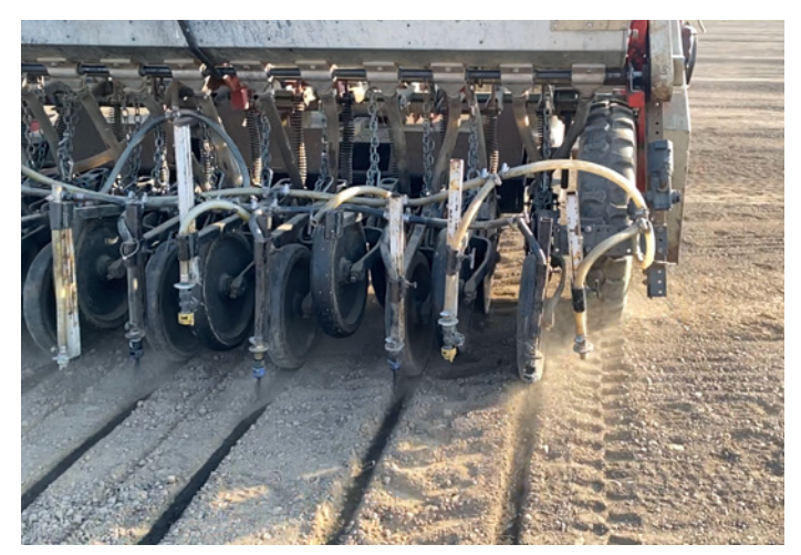
Biochar slurry application using a sprayer.

Micronized biochars can be suspended in water and injected into the root zone of perennial crops or fertigated, which could provide a slow but steady method of adding biochar to the root zone via irrigation water.