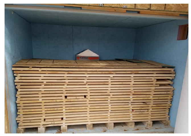
The NFS kiln will be used to provide high-quality dry lumber to LPS stduents.

Aside from the lumber use aspects of the project, the Nebraska Forest Service will also conduct a cost assessment related to the manufacture and drying of urban lumber. The intent is to develop information which can be used by portable sawmill operators to gain a better understanding of costs associated with producing lumber from community trees.