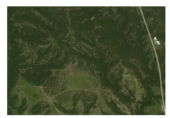
Example of aerial view before classification

Niobrara Valley - Approximately 121,000 acres of forest were found in the Niobrara Valley project area. There were 79,000 acres of classified as heavy density, 24,000 acres in light density and 18,000 acres of savanna forests.