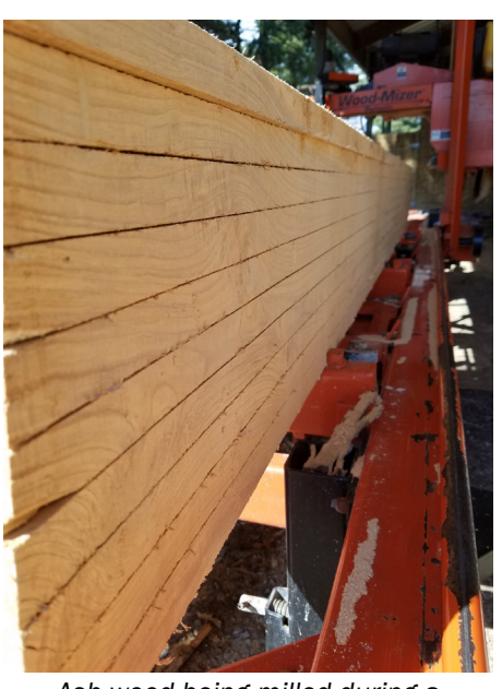
Ash wood being milled during a demonstration project in 2017.

Over the next couple of months, the City will be providing ash logs to the Nebraska Forest Service. The Nebraska Forest Service will then process those logs into 4/4 and 8/4 (1" or 2") lumber and dry the lumber in its dehumidification kiln in Plattsmouth. The lumber will be provided to Lincoln Public Schools in time for the Fall 2018-Spring 2019 school year. During the school year, an evaluation of the lumber will take place to determine if there were unacceptable defects or other characteristics which made the urban ash lumber problematic during the student projects.