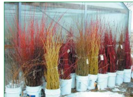
Woody floral stems in storage buckets

The length of time woody floral stems can be viably stored is determined by evaluating stem color intensity, flexibility, tip die-back and shoot and root growth. After several months of stor-