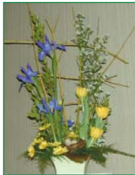
Fresh floral design with trellis made from yellow dogwood stems.

Any woody species with a colorful or unusually shaped stem, bud, flower, fruit or bark can produce a decorative woody floral product. Floral designers use these products to enhance arrangements and profit margins by adding interesting color, texture or form and increasing width and height.