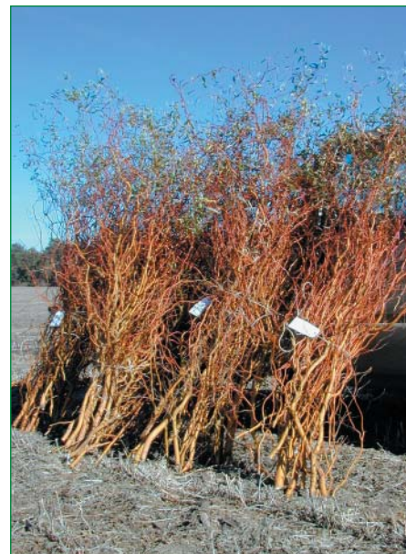
Scarlet Curls® willow yield of five plants harvested

Gross financial returns from integrated plantings using woody florals in alley cropping systems can be substantial (Table 4). Many woody florals can be produced in the Midwest, and some cultivars can generate gross incomes ranging from $8,843 to $16,308 per acre, per year (utilizing 2005 yield data) beginning two to three years after planting, depending on species and spacing. Net income will depend on operational efficiency and cost management.