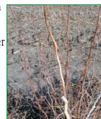
Deer rub on curly willow stems

Harvesting woody stems in late winter or early spring may allow white-tailed deer to have unlimited access to plants during most of the winter, resulting in high levels of browse and rub damage. Deer browse damage can be especially