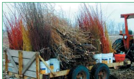
Hauling harvested woody floral stems

Harvested woody floral stems should be stored in clean water or a 10 percent water: bleach solution at 34-40° F. A dark cooler is optimal