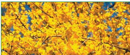
Forsythia branches in bloom

Plants that produce woody floral products include species such as curly or corkscrew willow, Scarlet Curls ® willow, fantail willow, pussy willow, red and yellowtwig dogwood and red (sweet) birch. Holly is valued for its evergreen leaves (in some species) and bright red berries. Witch hazel, redbud, quince, forsythia, apple, cherry and plum, among others, are prized for their forced flowers.