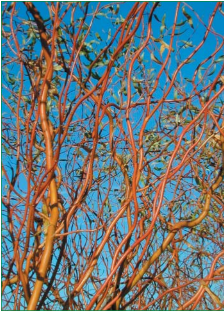
Scarlet Curls® willow stem color