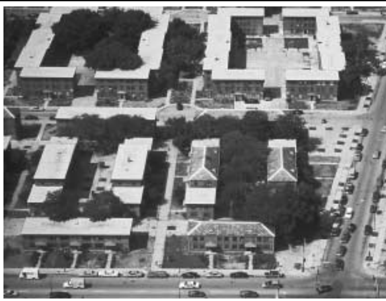
Figure 2: Aerial View of a Portion of Ida B. Wells Showing Buildings With Varying Amounts of Tree and Grass Cover

was full and the grass was green. For each building, the aerial slides were put together with slides taken at ground level; there were at minimum three different views from aerial and ground-level photos of each space (front, back, left side, and right side) around each building. Five students in landscape architecture and horticulture then independently rated the level of vegetation in each space. Each of the individuals rating the spaces received a map of the development that defined the boundaries of the specific spaces under study. The raters viewed the slides and recorded their ratings on the maps. A total of 220 spaces was rated, each on a 5-point scale (0 = no trees or grass, 4 = a space completely covered with tree canopy). Interrater reliability for these ratings was .94. 1 The five ratings were averaged to give a mean nature rating for each space. The nature ratings for the front, back, and side spaces around each building were then averaged to produce a summary vegetation rating. Ratings of vegetation for the 98 buildings ranged from 0.6 to 3.0.