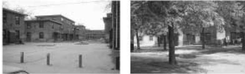
Figure 1: Ground Level View at Ida B. Wells Showing Apartment Buildings With Varying Amounts of Tree and Grass Cover

leaving some areas completely barren, others with small trees or some grass, and still others with mature high-canopy trees (see Figure 1). Because shrubs were relatively rare, vegetation at Ida B. Wells was essentially the amount of tree and grass cover around each building.