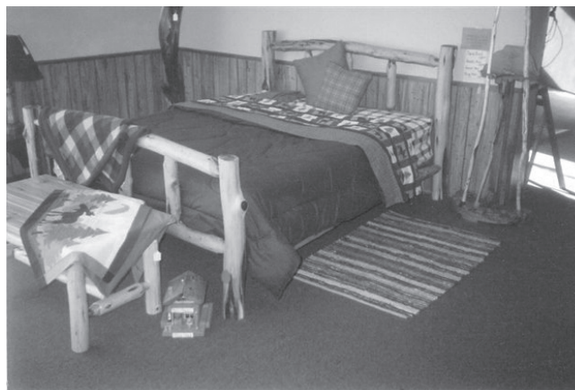
Barager rustic furniture.

Ten Acre Woods can be contacted at: HC 62, Box 48, Long Pine, NE 69217; phone: 402-387-1268. The full line of Ten Acre Woods’ products can be viewed on the Niobrara Valley Wood Products website: www.niobrara-valleyproducts.com .