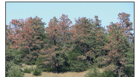
Ponderosa pine stand damaged by Diplodia blight following a hailstorm.

In particular, Diplodia blight often develops following hailstorms because the latent infections take advantage of hail-damaged branches. In such cases, some trees may recover with the loss of only a few branches, while trees more severely damaged may die.