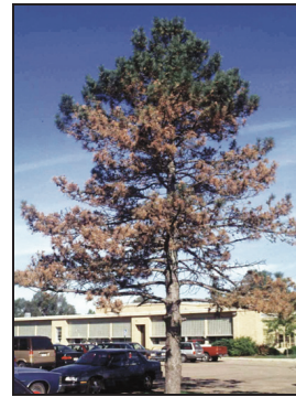
Above right: Progressive loss of lower branches.