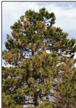
Below left: Scattered branch death. Below right: Top kill.