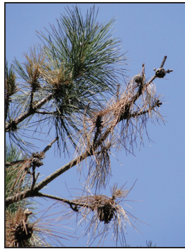
Above left: Branch killed by Diplodia blight.

Severe damage is generally seen in mature trees, although young trees planted below older pines may be affected. Trees with extensive damage may ultimately die.