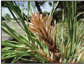
Diagnostic symptom of Diplodia blight: dead, stunted shoots.

The most distinguishing characteristic of Diplodia blight is the presence of dead, stunted needles at the tips of branches (hence the common name, "tip blight"). The needles die in spring when the developing shoots are attacked and killed by the fungal pathogen.