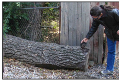
This walnut log in Denver, Colorado, cannot be transported into or through Nebraska.

Walnut grown in Nebraska is not under the quarantine and may be moved within the state. Other states, however, may prohibit the importation of Nebraska walnut. Contact the Nebraska Department of Agriculture for more information (see back panel).