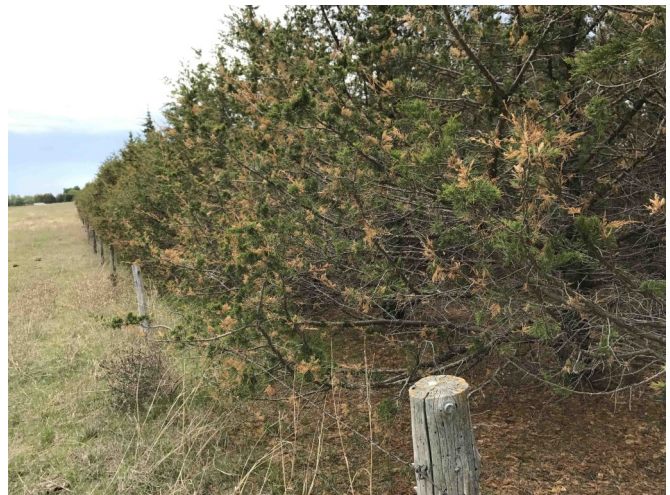
Flagging in eastern redcedar windbreak attributed to cedar bark beetle

Mountain pine beetle populations in western Nebraska seem to have returned to the low levels that existed prior to the 2009 outbreak.