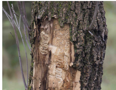
EAB tunnels in ash in Greenwood, Nebraska

Emerald ash borer (EAB) was found for the first time in Nebraska in 2016. Infested trees were found in Omaha (Douglas County) and in Greenwood (Cass County). No additional infestations were found in 2017. Five counties (Douglas, Cass, Dodge, Washington and Sarpy) are included in a quarantine to restrict the movement of ash and other hardwood materials. Treatments should be considered only within 15 miles of a known EAB location. (More information can be found at eabne.info )