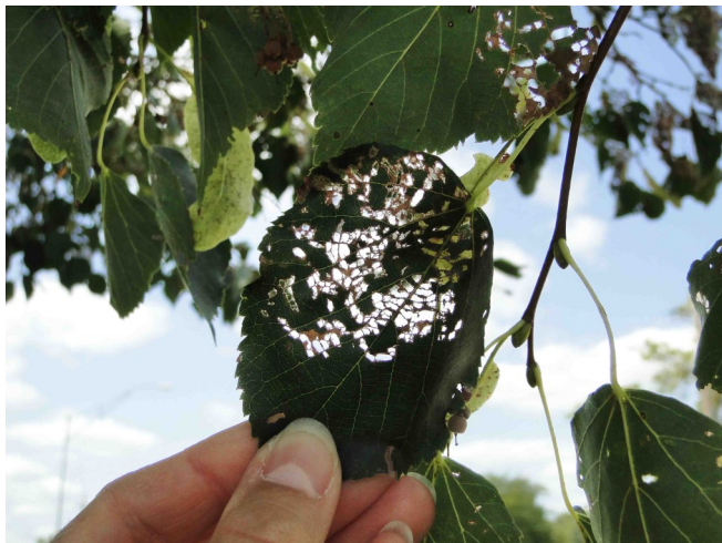
Leaf feeding damage on linden by Japanese beetle