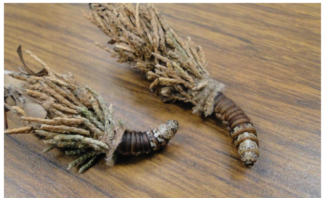
Bagworm larvae with their bags