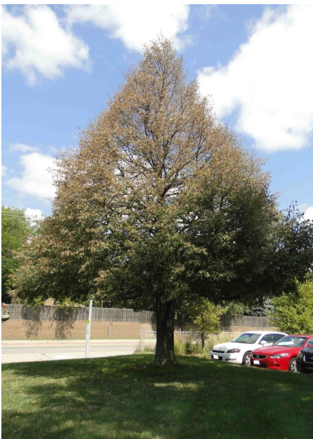
Linden defoliated by Japanese beetle

Japanese beetle populations were very high in many locations in 2017. Linden trees were frequently reported to be severely defoliated. Other severely affected tree and shrub hosts included cherry, peach, birch, and hazelnut. The Nebraska Department of Agriculture lists 30 counties as infested in 2016.