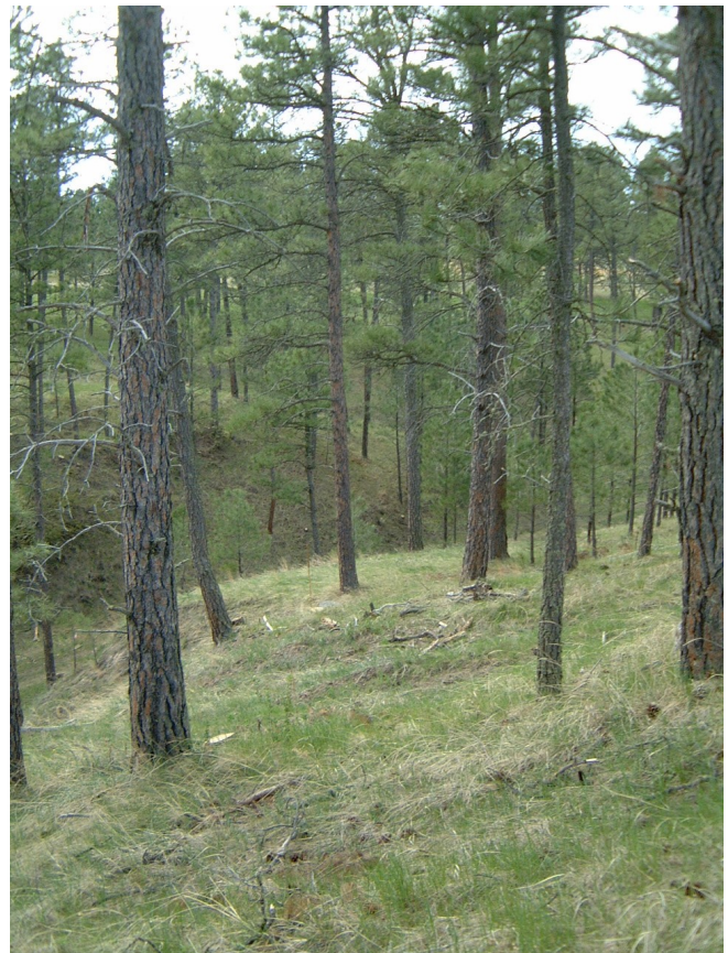
Thinned ponderosa pine. Top photo: Niobrara River

The dominant species of Nebraska's non-forestland with trees (defined as less than one acre, less than 120 feet wide and less than 10% stocked) are eastern redcedar, Siberian elm, hackberry, red mulberry and ash. These trees provide unique benefits such as rural home wind protection, snow drift management, energy savings, livestock protection, crop protection and yield increases, water quality and soil protection, wildlife habitat and other ecosystem services. Although not large units individually, combined these areas are important components that provide key and essential ecosystem services in Nebraska's rural agriculture-dominated landscape.