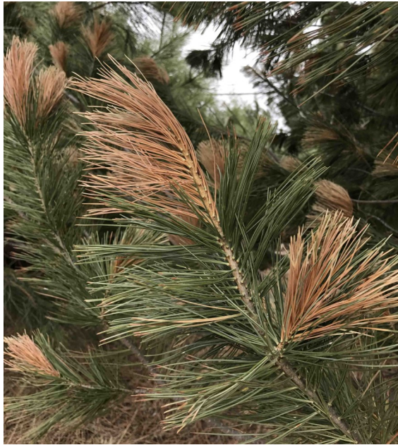
Limber pine browning in spring following a dry summer and fall and below zero temperatures the previous fall

Browning of evergreens particularly in western Nebraska was noted in early spring of 2017. Extremely low temperatures in December of 2016 preceded by a very dry summer and fall appear to have been responsible. Temperatures were colder than -20F in December in some locations.