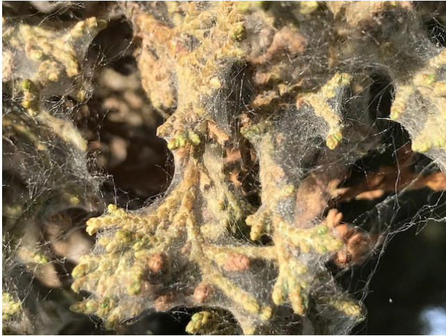
Rocky Mountain juniper with extensive webbing caused by spider mites

Spider mites were a problem in 2017, affecting both broadleaf and conifer trees, especially in western Nebraska. Affected foliage showed yellowing and browning and often was covered with extensive webbing. Two-spotted spider mite appeared to be responsible in many cases.