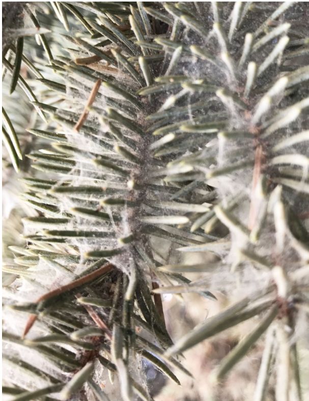
Spruce with extensive webbing caused by spider mites