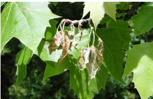
Sycamore anthracnose shoot blight