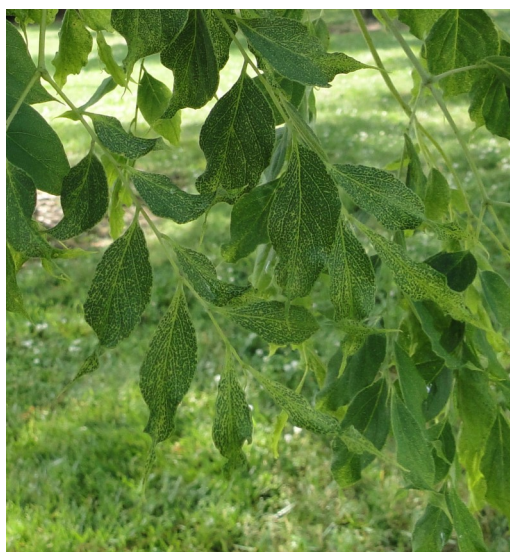
Herbicide induced distortion and discoloration of Kentucky coffeetree leaves