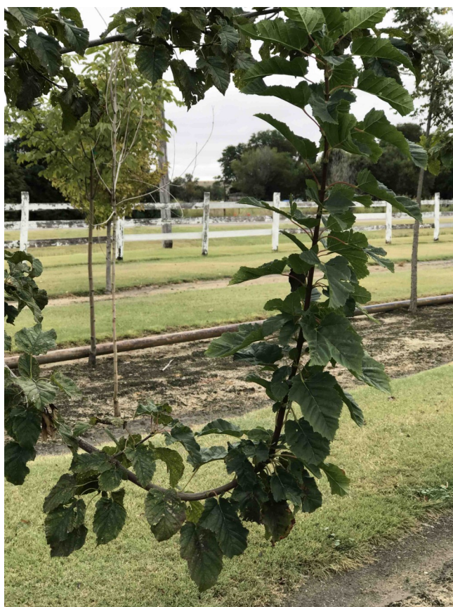
Distorted branch formation in nursery tree affected by herbicide, making tree unsalable

Damage to trees from herbicides was widespread and sometimes severe in 2017. Nursery trees in some cases were so severely damaged as to be a total loss. Certain herbicides, such as 2,4-D and dicamba, that are commonly used in agricultural fields and in urban landscapes often drift or volatilize and damage trees nearby. The use of dicamba on dicamba-tolerant soybeans is becoming a serious threat to trees near areas where it is applied.