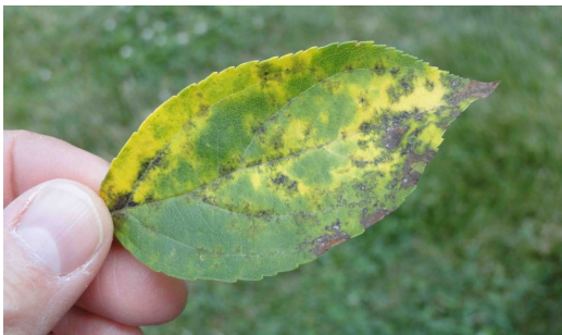
Apple scab foliar symptoms include feathery black spots and general leaf yellowing and browning