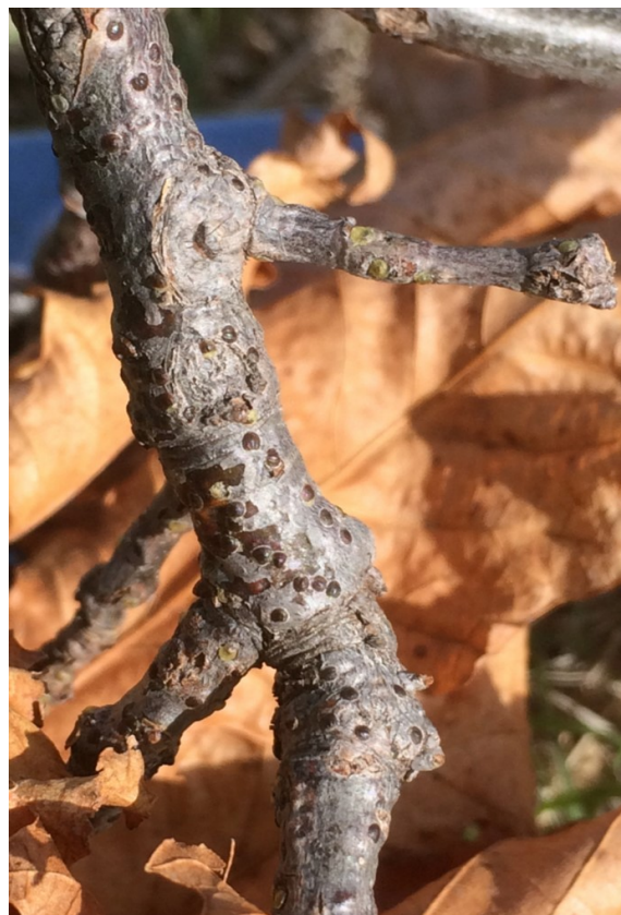
Golden oak scale

Golden oak scale was reported on oaks in central Nebraska in 2017. This pit-making scale is easily overlooked and is not often reported. Scales commonly found in Nebraska include oystershell, scurfy, pine needle, and kermes scale.