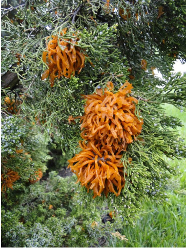
Orange spore masses from Gymnosporangium rust galls on juniper

Foliar diseases were a problem again in 2017, including Gymnosporangium rusts, apple scab, anthracnose, oak leaf blister ( Taphrina ) and Mycosphaerella leaf spot of ash. Foliar symptoms were common, but no significant damage was seen.