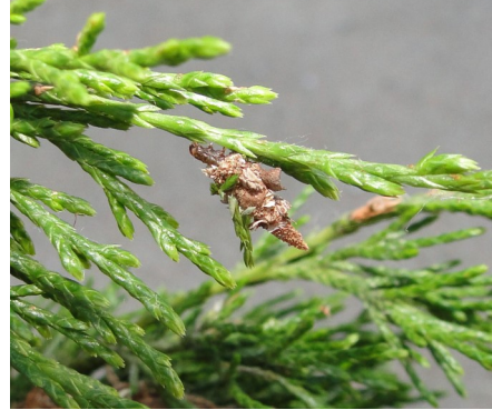
Young bagworm caterpillar on Juniperus species

Bagworm continued to be a problem in 2017, particularly in south central and south eastern areas of the state. Bagworm is commonly found in windbreaks on spruce, juniper and eastern redcedar, but also attacks a number of broadleaf trees.