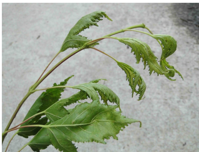
Distorted leaves of maple typical of plant growth regulator herbicides such as 2,4-D or dicamba