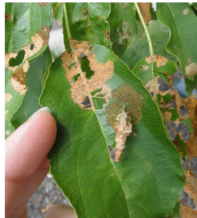
Bagworm bag and feeding damage on crabapple