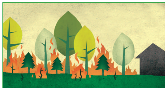
Surface fuels, such as low-growing shrubs and debris, provide the pathway for making a surface fire a crown fire.

After you move, there are a number of things you can do to protect your home from fire.