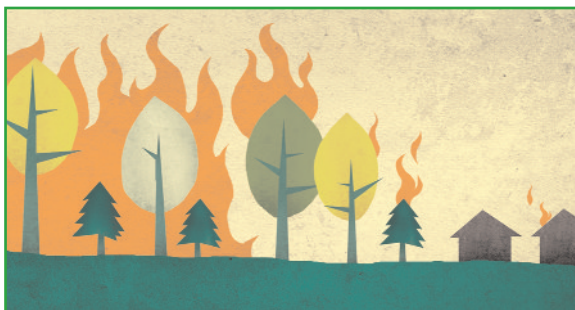
Crown fires are much more difficult to contain than surface fires, making them much more destructive.

The most effective fire prevention device yet invented is YOUR attitude. With a positive, proactive attitude you can enjoy your country home with confidence by following the prevention measures suggested here.