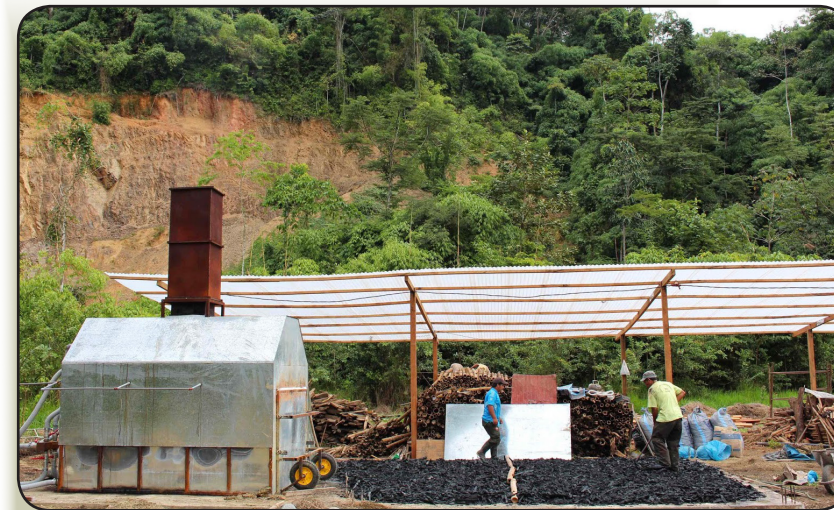
A large-scale retort kiln produces biochar from locally-sourced biomass

Nebraska is home to a wealth of untapped resources, some that are viewed as problematic. Nebraska has 1.3 million acres of forested land containing over 41 million oven-dry tons of standing woody biomass. This includes hundreds of thousands of acres of eastern redcedar that needs removal to improve forest health. Not included in this statistic are the acres of pastureland upon which eastern redcedar has encroached, nor the hundreds of communities that deal with storm damaged trees, hazardous tree removal, and trees that will come down as a result of emerald ash borer infestation.